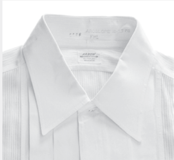
From page 55