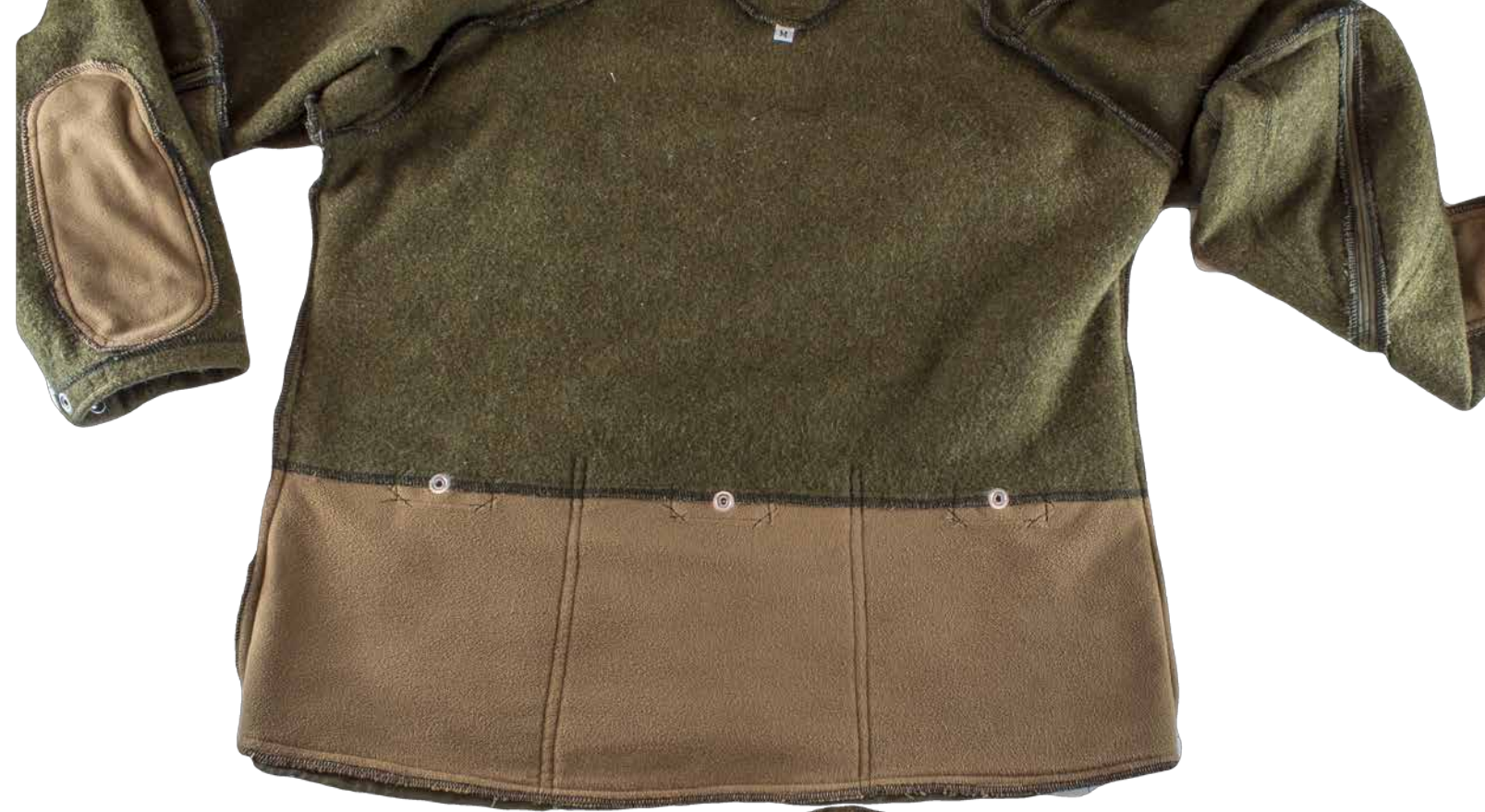
Empire Wool&Canvas Grey Fox hooded prototype courtesy of Kevin Kinney, prop. Click here for his website.