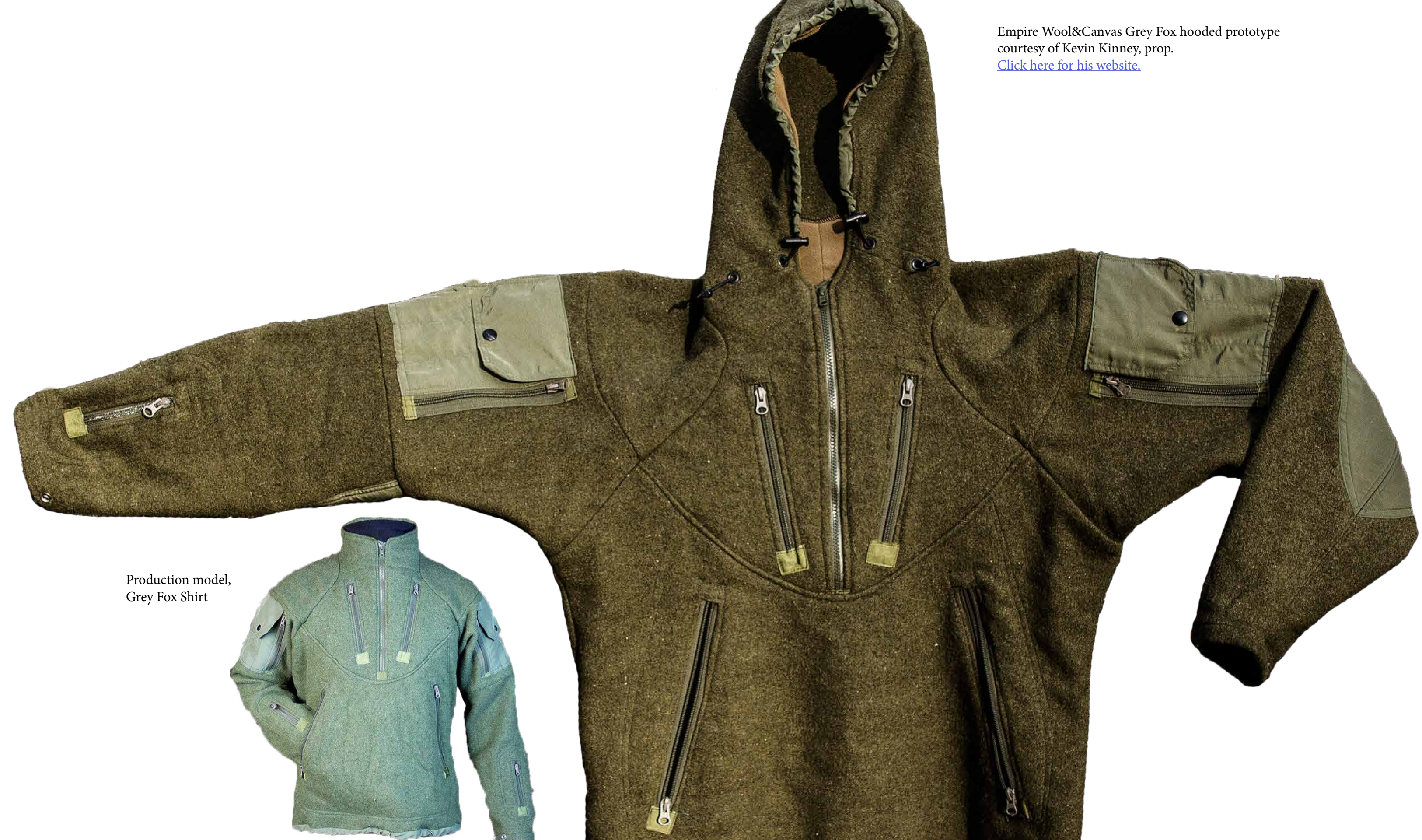
Production model, Grey Fox Shirt

Empire Wool&Canvas Grey Fox hooded prototype courtesy of Kevin Kinney, prop. Click here for his website.